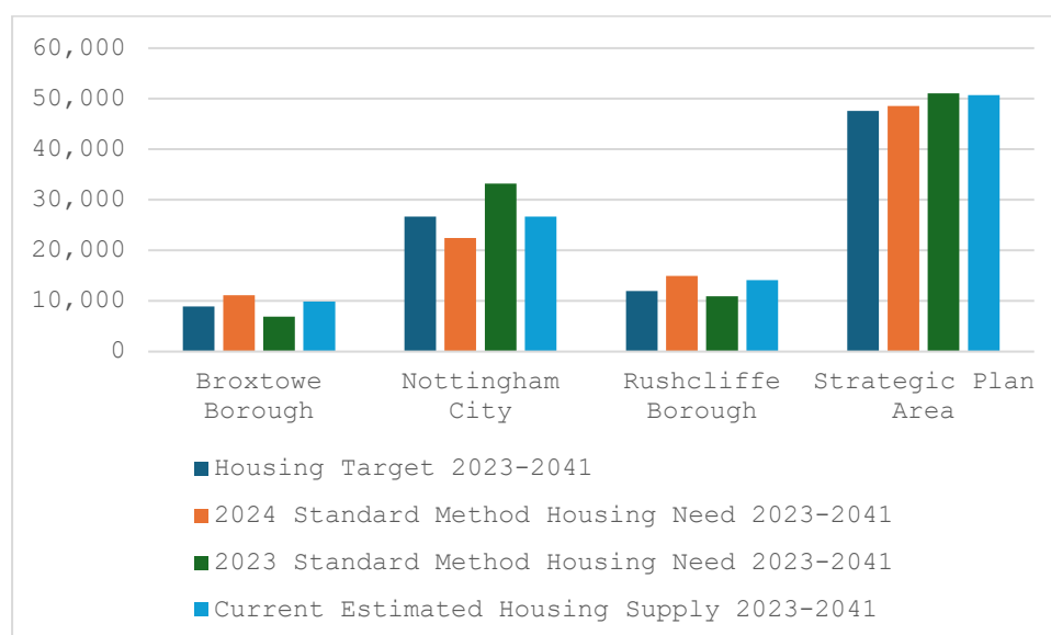
Figure 1: Summary of Housing Need, Targets and Supply 2023 to 2041

4.18 Figure 1 shows how the housing targets compare with housing need calculated using both the 2024 standard method and 2023 standard method, and housing supply.