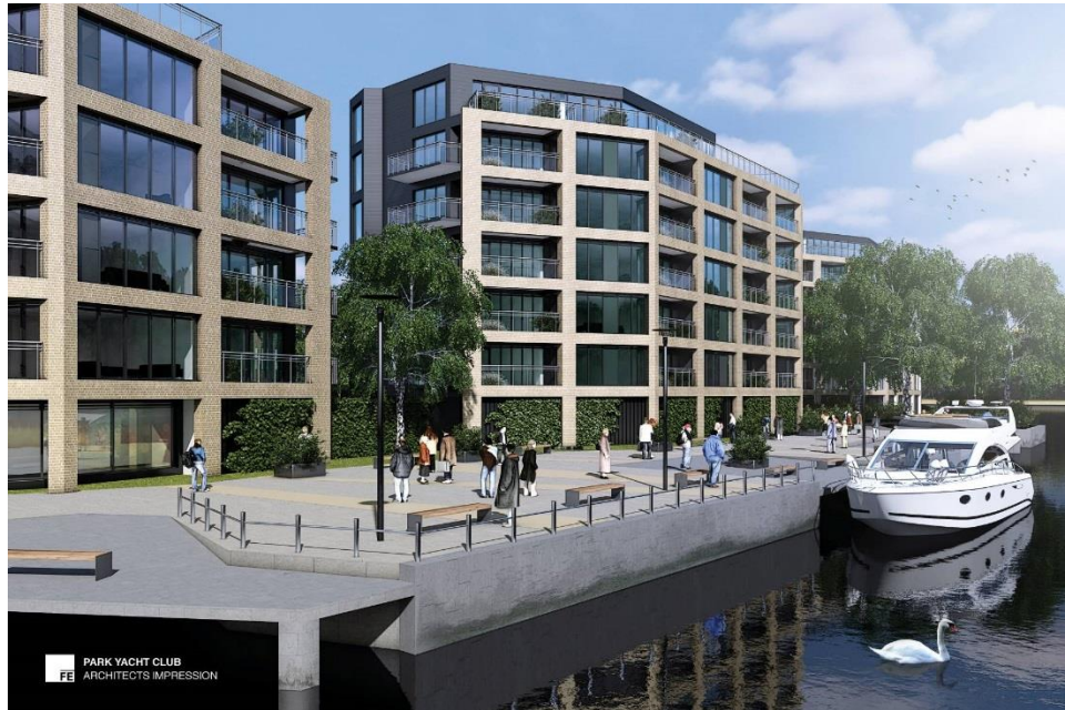
Park Yacht Club