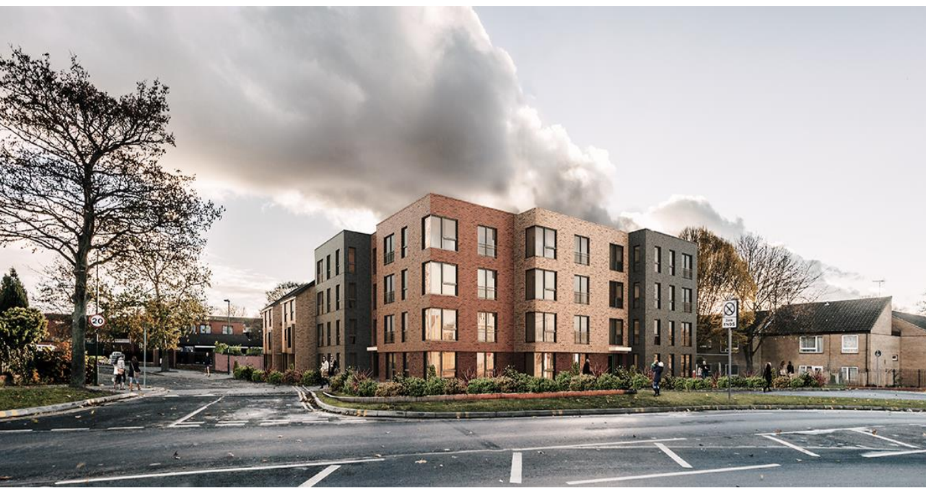
Meadows – Arkwright Walk