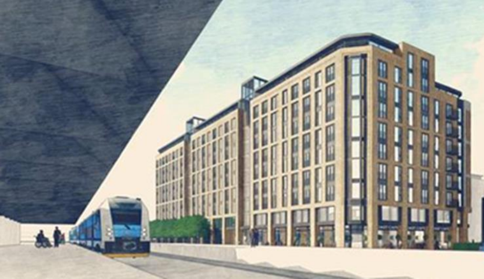
Network Rail (Queens Road adj Station)