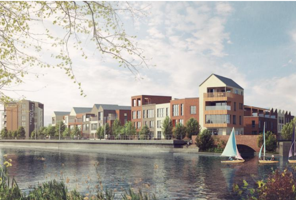
Trent Basin Phase 2