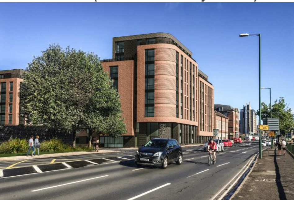
Chainey Place – (facing London Rd)