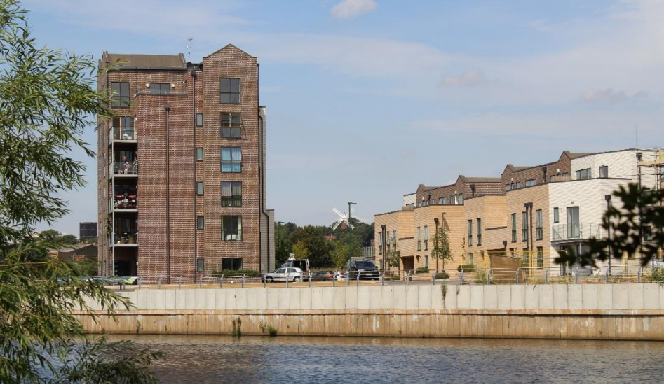
Trent Basin Phase 1