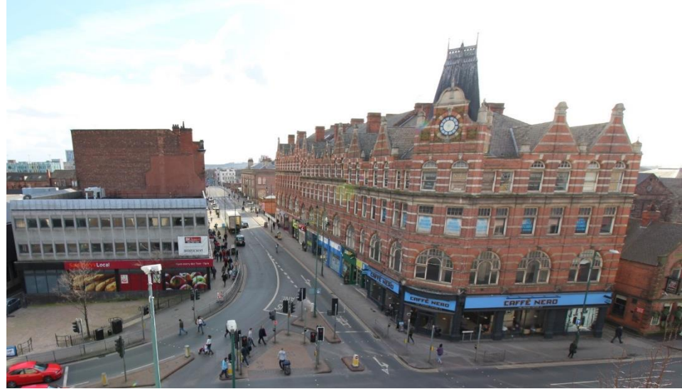
City Buildings (Carrington Stree)