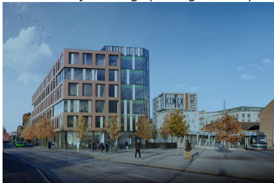
Crocus Place (south of Station)